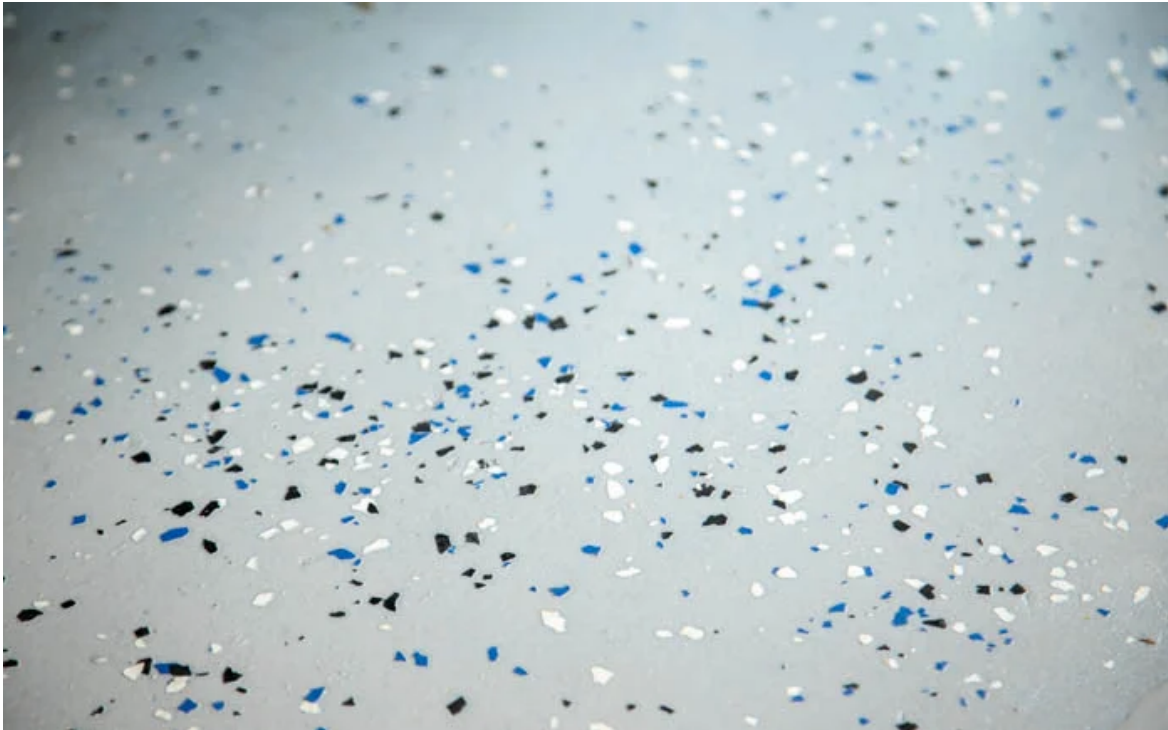
Epoxy coating is one popular way to dress up a garage floor.

Best of all? You'll get a superior bond that cures fast and can even be used after an hour.