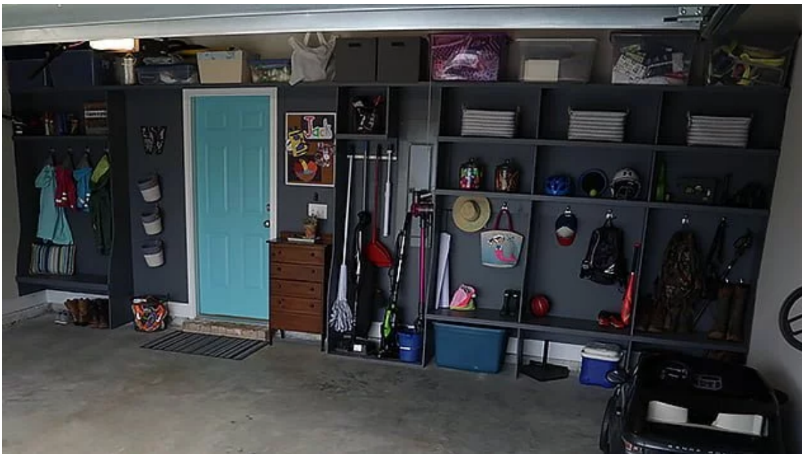
Locker-style storage provides a place for everything in your garage.

Another bonus? You'll have the nicest garage floor on the block!