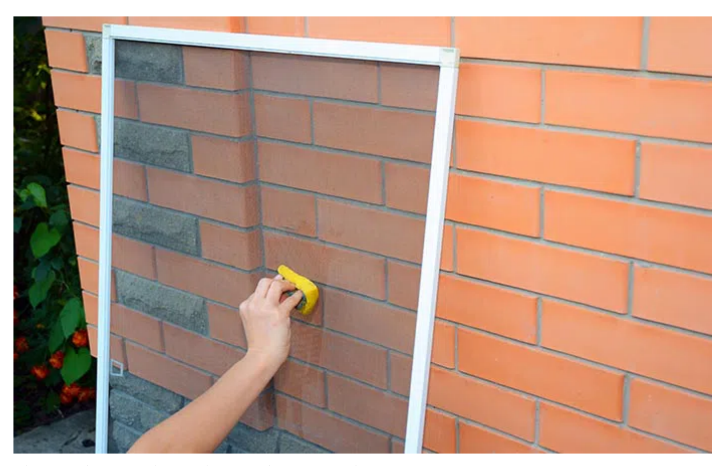
Cleaning window screens takes so much time — unless you vacuum them!

Next, mix vinegar with warm water, 50-50, to clean the window glass, and wipe it down with newspaper. Using natural products, not chemicals, is great for the environment and easy on your lungs, and the newspaper won't leave behind tiny fibers like paper towels would.