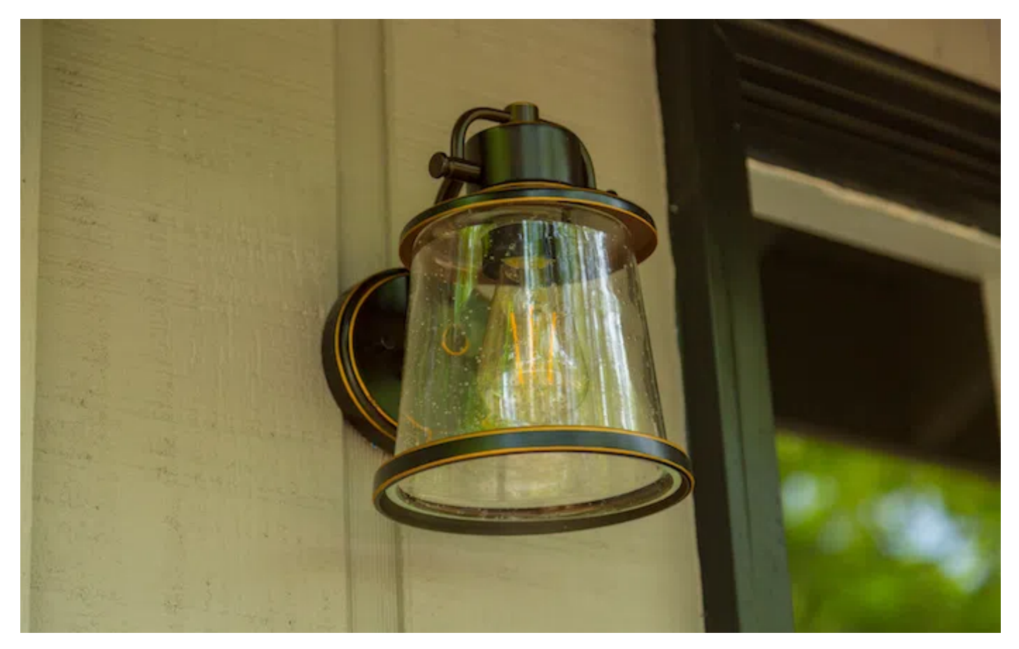
Dirty light fixtures leave the wrong first impression — now, you can clean them without much work.

Your home can have lots of charm and <u>curb appeal</u>, but a dirty light fixture can leave the wrong first impression.