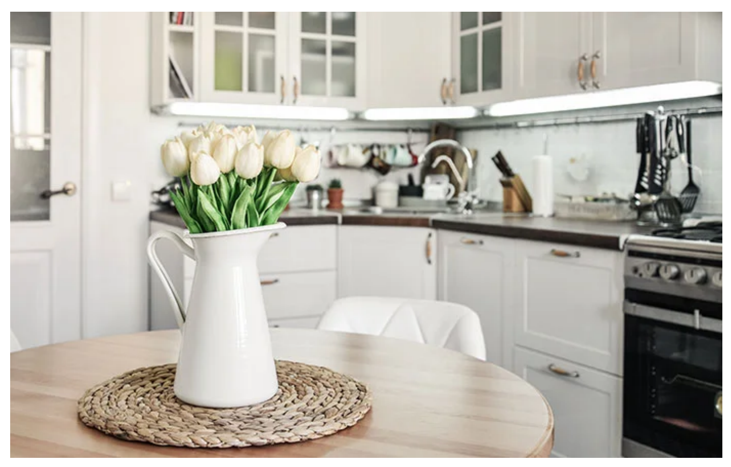
An oversized pitcher can add height, dimension and texture to a kitchen.

Read our Guides, <u>8 Tips for Choosing and Growing Houseplants</u> and <u>Best</u> Houseplants to Improve Indoor Air Quality for more information.