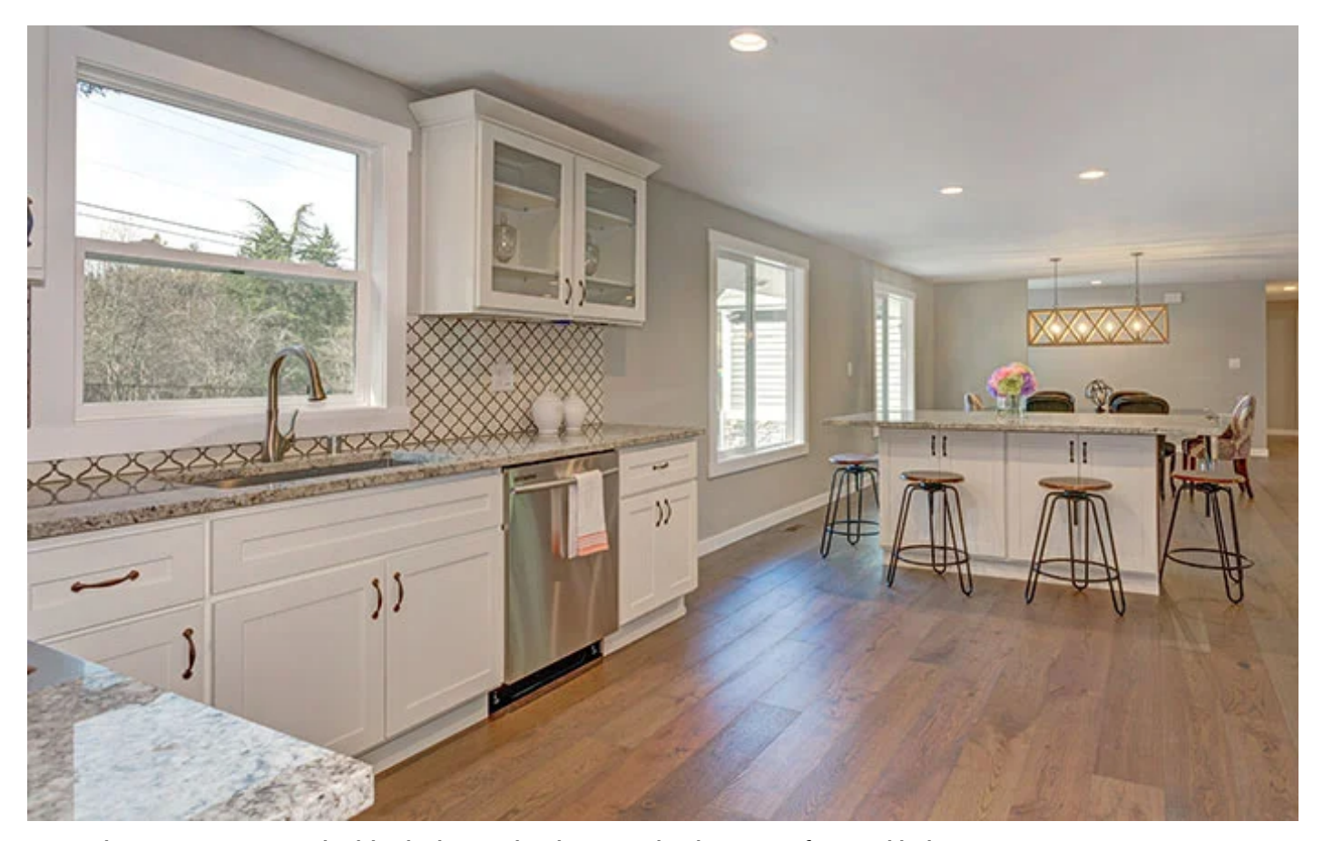
Open the curtains or raise the blinds during the day to make the most of natural light.

Watch KineticTV's house tour above, and read along for how to live large on an average homeowner's budget. (The following photos aren't from White's home; they're examples of how average homes can enjoy high-end style.)